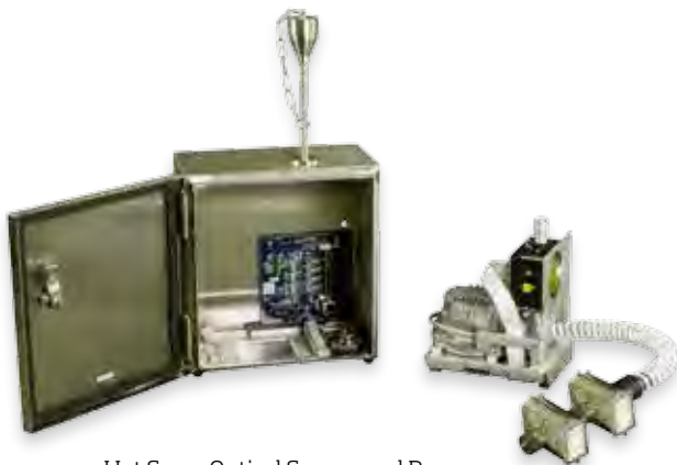
Hot Swap Optical Sensor and Pump